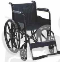
Model No. E-107 • Epoxy powder coated steel frame • Fixed arm rest & foot rest • Fiber molded mag wheel