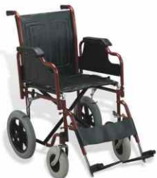
Model No. A-101