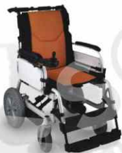
Model No. P-108