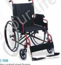
Model No. E-108 • Epoxy powder coated steel frame • Flip up arm rest • Detachable footrest

The below mentioned facilities are common in all here shown models