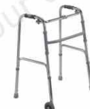
Model No. WL-106