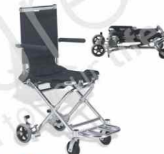
Model No. T-104