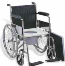
Model No. C-101 • Fixed arm rest & foot rest