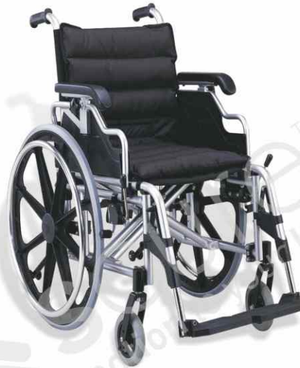
Model No. D-101