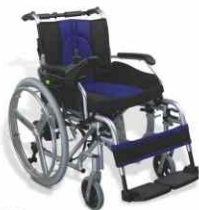
Model No. P-105