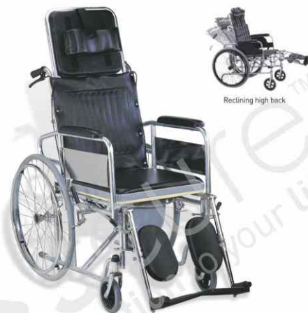
Reclining high back