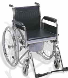
Model No. C-102 • Flip up arm rest & detachable, swinging foot rest