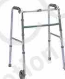
Model No. WL-105