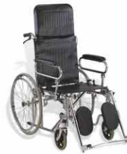
Model No. R-102