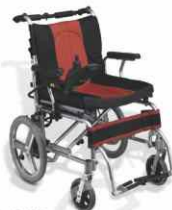
Model No. P-107