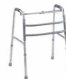
Model No. WL-102

Below mentioned facilities are common for above all shown models