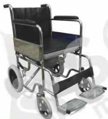
Model No. C-106 • Flip up arm rest & detachable, swinging foot rest

The below mentioned facilities are common in all here shown models