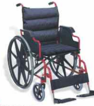
Model No. D-102