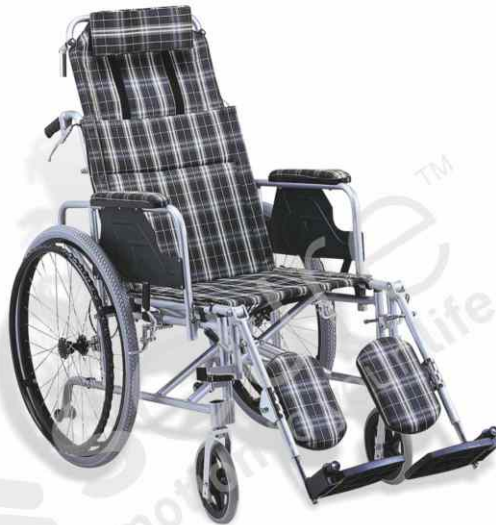
Model No. R-101