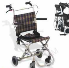
Model No. T-102