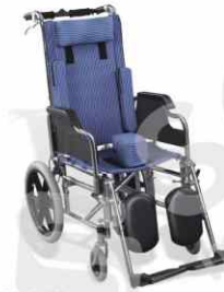
Model No. R-105