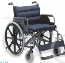
Model No. D-104