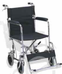
Model No. A-102