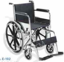
Model No. E-102 • Chrome plated steel frame • Fiber molded mag wheel • Fixed arm rest & foot rest