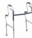
Model No. WL-103