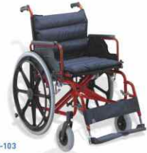
Model No. D-103