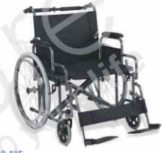
Model No. D-105