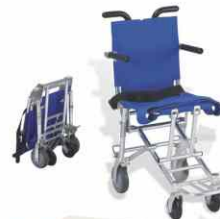
Model No. T-103