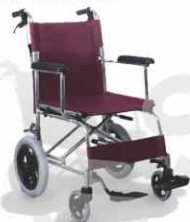
Model No. A-103