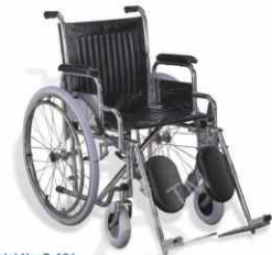
Model No. R-104

The model designed with leg immobilization