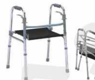
Model No. WL-104