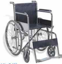
Model No. E-101 • Chrome plated steel frame • Fixed arm rest & foot rest Hospital Bed